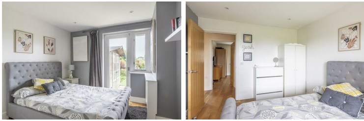
Bedroom 4 11'7" x 8'0" (3.55 x 2.44)