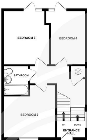
GROUND FLOOR 44.2 sq.m. (476 sq.ft.) approx.